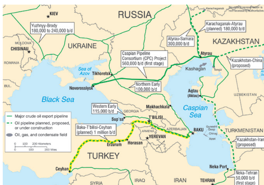
Figure 1. Black and Caspian Sea Oil Pipelines